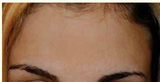
ACNE SCARS